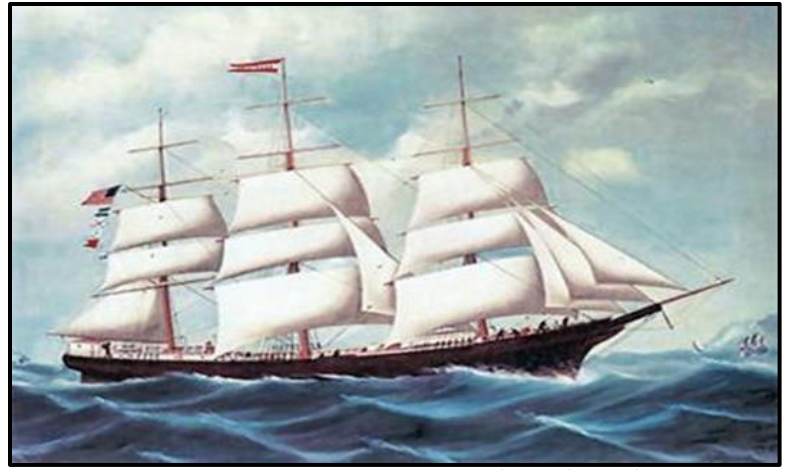
The Emily Reed 1880-1908